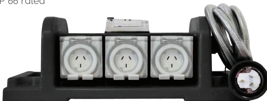
1 PHASE 10 OR 15 AMP CONNECT